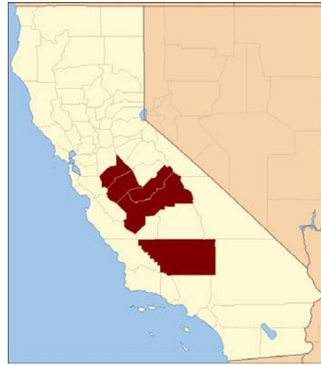
Figure 3: Location of the five leading almond producing counties in California [11] .

and warmer temperatures at bloom have also contributed to the popularity of almonds in the San Joaquin Valley [4] .